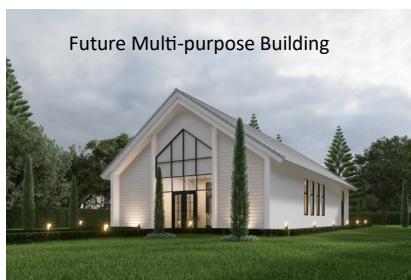
Future Multi-purpose Building

Please pray for Thailand as there has been massive flooding in the entire country. Thankfully, our villages have not been flooded. Unfortunately, Ping's house in another province flooded three times.