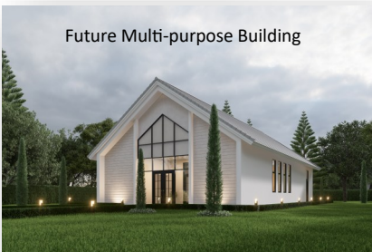
Future Multi-purpose Building